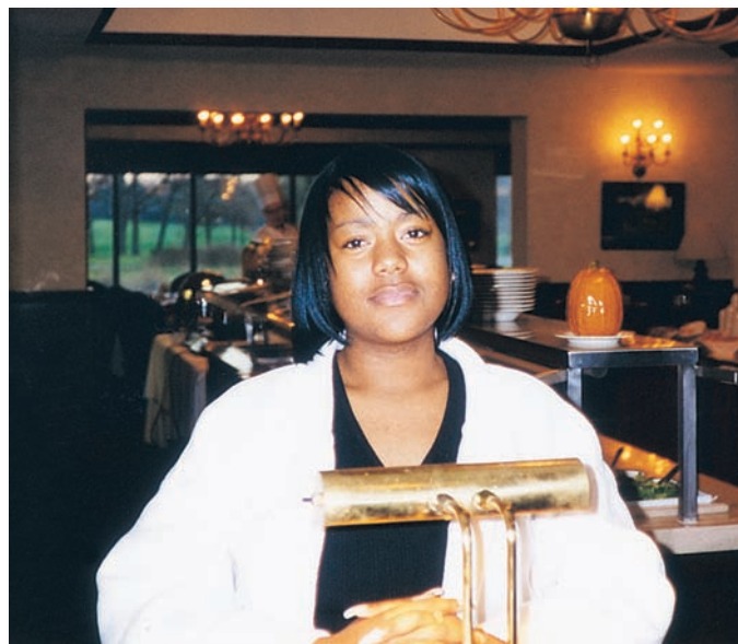
Thornridge High School

Cooperative education is a school program that prepares students for an occupation through a paid job experience. Cooperative education programs are also called co-op programs . They team a school with a local employer who agrees to hire a student part-time and pay an hourly wage. The employer provides job training to help a student prepare for a career goal.